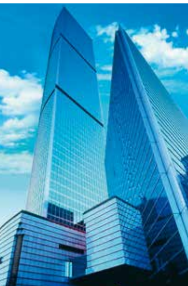
Ningbo ROWA Coatings

ROWA GmbH was established in 1958 in Seevetal near Hamburg as a rubber-processing company. In 1969 the company started to produce high-quality lacquer systems, matting concentrates and additive systems for the coatings and plastics industry.