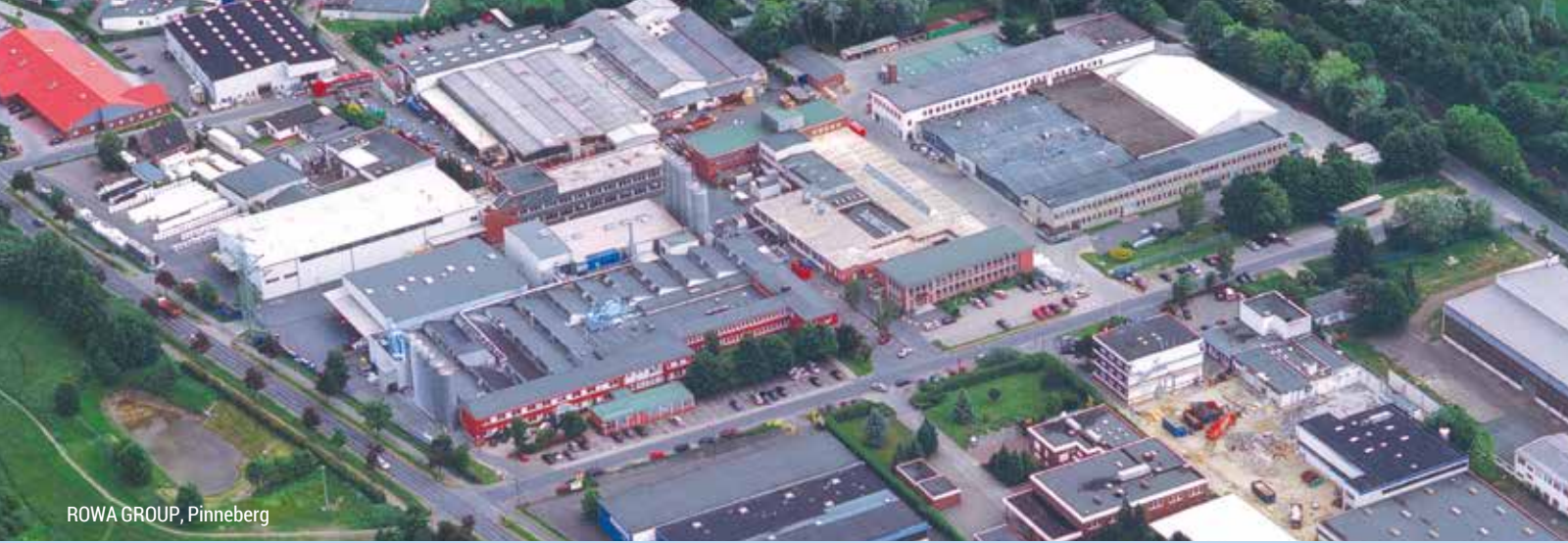
ROWA GROUP, Pinneberg